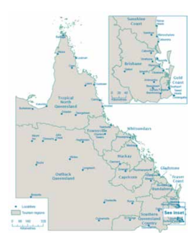
Table 3: Queensland tourism campaign regions

We used the campaign regions because they provide a reasonable level of geographic coverage that matches data availability. Data availability and quality deteriorate with datasets that aggregate tourism activity at smaller geographic scales.