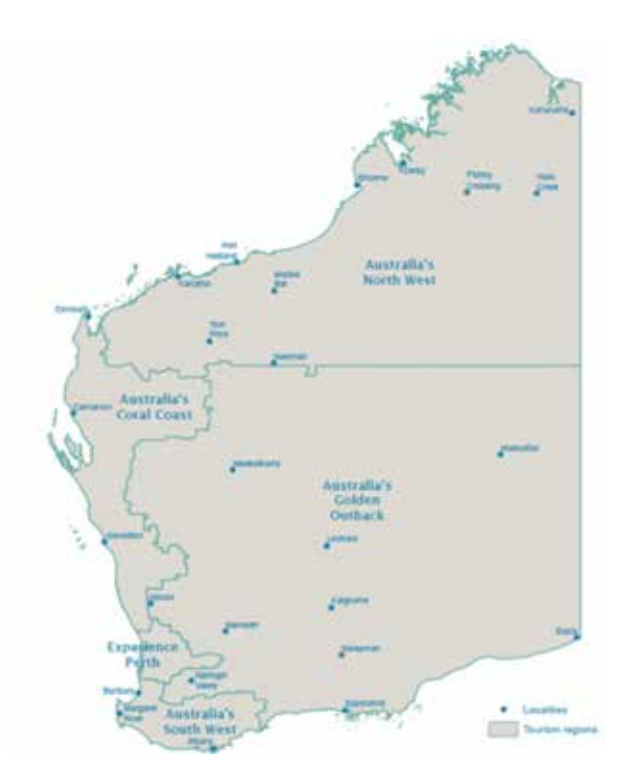
Table 3: Western Australian tourism campaign regions

We used the campaign regions because they provide a reasonable level of geographic coverage that matches data availability. Data availability and quality deteriorate with datasets that aggregate tourism activity at smaller geographic scales.